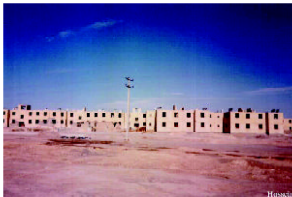
Figure 21. Severely damaged or totally collapse penthouses in the residential complex two story buildings.