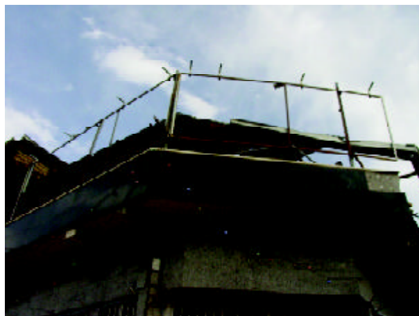
Figure 41. Collapse of tablets and bill boards in a commercial building.