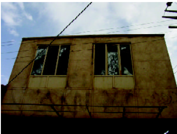
Figure 34. Damage to the glasses of widows in the second story of a residential building.

Figure (34) shows the broken window glasses of a building, while no crack can be seen on the veneer of the walls. The same case is seen in Figures (35) and (36). This shows that the window glass is more vulnerable than the brittle facades. Nevertheless, in