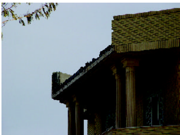
Figure 39. Partial collapse of parapets in a two story building.