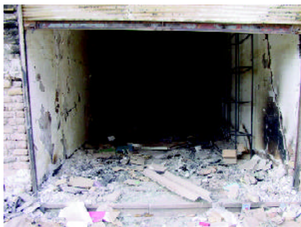
Figure 49. A partially burnt shop which got in fire because the failure of its electrical facilities.

As in many of the past earthquake this event had also some cases of post earthquake fires, which were mainly due to the damage to the electrical facilities. Figure (49) shows a partially burnt shop, which caught fire because the failure of its electrical facilities. The fire caused of the deformation of the broken glass pieces as shown in Figure (50).