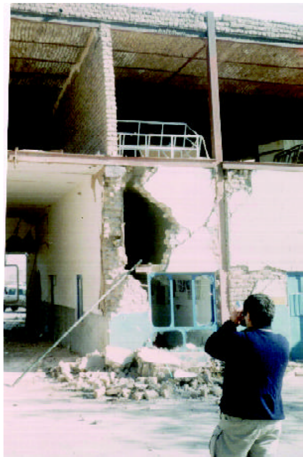
Figure 1. Collapse of the external walls made of brick masonry in Emdad Khodro building.

Several cases of damage to external wall masonry were observed, of which some samples are shown in Figures (1) to (4). It is seen in Figure (1), which is related to the recently constructed Emdad Khodro building located beside the Kerman-Zahedan road, that the external walls in the second story and a part of it in the first story of the building have fallen out. This building had a serious case of pounding as it is shown in the next pictures. The broken glasses of the window in the first story are also visible in the picture. Note that there is no sign of the interlocking between the remained wall in the second floor with the one formerly perpendicular to that, which is now fallen