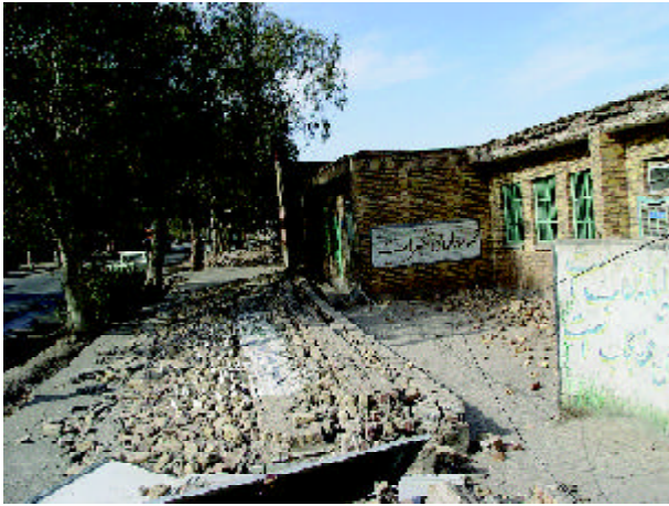
Figure 6. Topped brick wall - Note to the fallen parapets as well.