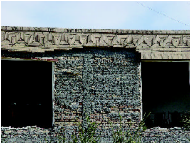
Figure 14. Failure of the brick facade in the external wall of a residential building - note to the popped out windows as well.

The sample of damaged stone façade is shown in Figure (17). The scattered locations of the detached tiles of the façade on the elevation of the building