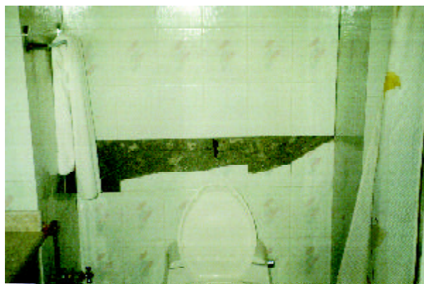
Figure 30. A sample damages to the ceramic tile interior veneers in the bath rooms of Azadi (Iran Parsian) hotel (Photo by M. Hosseini).

by glass mirror has remained intact. It is not easy to give a reason for this case. This reasoning difficulty is also true for the form of damage in the tile veneer shown in Figure (30).