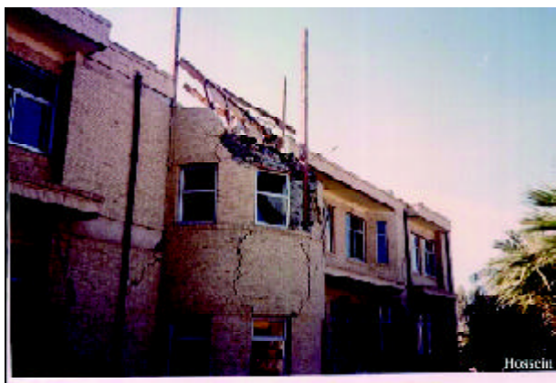
Figure 18. Severely damaged staircase roof in the office building of the city electric substation-Note to the broken glasses as well.

the inspected buildings the main reason of collapse of the penthouses has been the lack of structural system or lack of structural integrity [31]. They also states that according to the inspection in more than 25% of cases both stairs and their sidewalls have been damaged, in more than 20% of cases just the sidewalls were damaged, while the stair itself was undamaged, and in less than 10% of cases, the stair has been damaged, while its sidewall was undamaged.