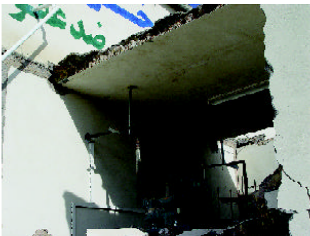
Figure 3. Complete failure of the external wall with partial collapse of the ceiling in the motor house of Khormaye Shargh export company.