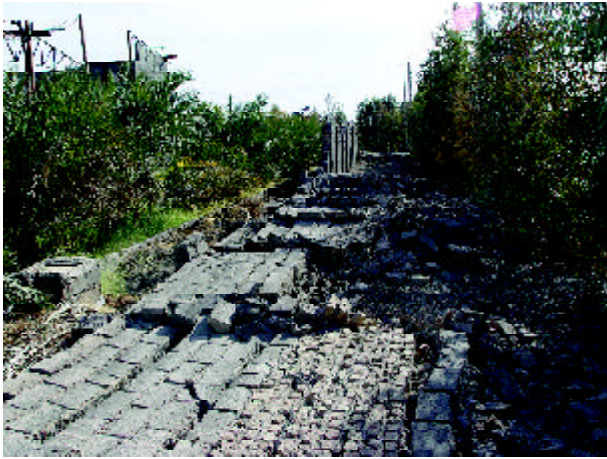
Figure 7. Topped concrete block (partially brick) wall.