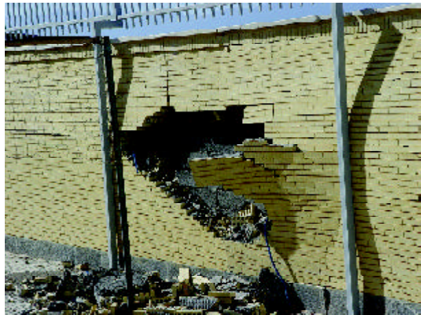
Figure 13. Damage to the brick facade in a yard wall (Photo by Mahmood Hosseini).

An interesting point, which is visible in Figure (13), is the lack of cohesion between the main wall masonry and the brick façade. The very clean surface of the concrete block masonry of the wall in this figure shows clearly this lack of cohesion. In the special case shown in this figure it seems the vertical box profiles of the top fence have prevented the façade from the complete collapse. Other interesting point is the detachment of the group of bricks with the used mortar behind them, which are stuck together and made a big piece of debris. It is obvious that falling of such a big piece from a high elevation can be very harmful to the subjected people. Nevertheless, this type of integrity between the bricks and the mortar can help their retrofit as described in section 5 of this paper.