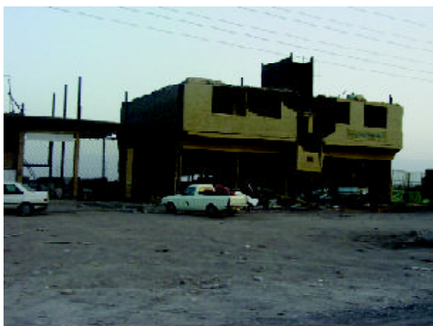
Figure 20. Severely damaged staircase in a commercial building.

The most important building in which this kind of nonstructural damage was observed was the Bam Airport Terminal. It can be realized in Figures (22) and (23) that although the false ceiling parts seem not to be heavy, because of their high length, on the one hand, and the strong vertical component of the ground motion, on the other, they have suffered from a kind of buckling instability, resulted in their falling down.