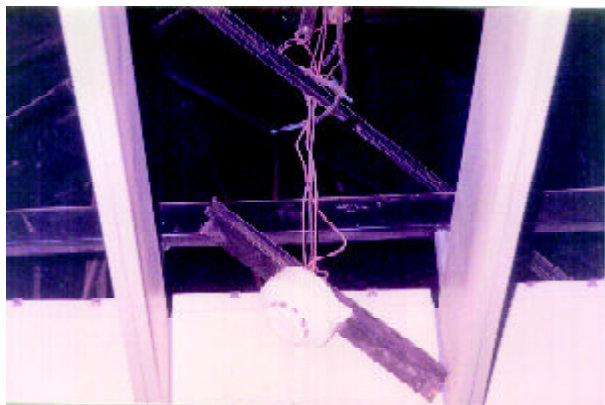
Figure 46. The failed smoke detector of the Bam airport.

this kind of failure seems to be the potential weak lines in the finishing due to the presence of the wire protection tubes, which are in fact some mainly hollow spaces. The partial failure of the ceiling in Figure (48) is also notable. This has been in fact an