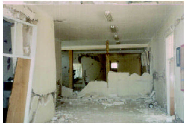
Figure 8. Severely damaged interior wall made of gypsum panels (Photo by M. Hosseini).

The most popular facade in Bam, as in many other cities in Iran, has been the fine brick masonry cover, called usually the 3cm brick facade. The stone tiles are the second some popular materials used as the