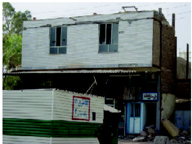
Figure 36. Damage to the glasses of widows in the second story of a residential building - Note to that horizontal damage line in the façade at the level of roof (Photo by M. Hosseini).

Figure (34) shows the broken window glasses of a building, while no crack can be seen on the veneer of the walls. The same case is seen in Figures (35) and (36). This shows that the window glass is more vulnerable than the brittle facades. Nevertheless, in