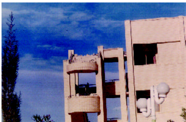
Figure 19. Damage to the staircase roof in the three story building of Azadi Hotel.