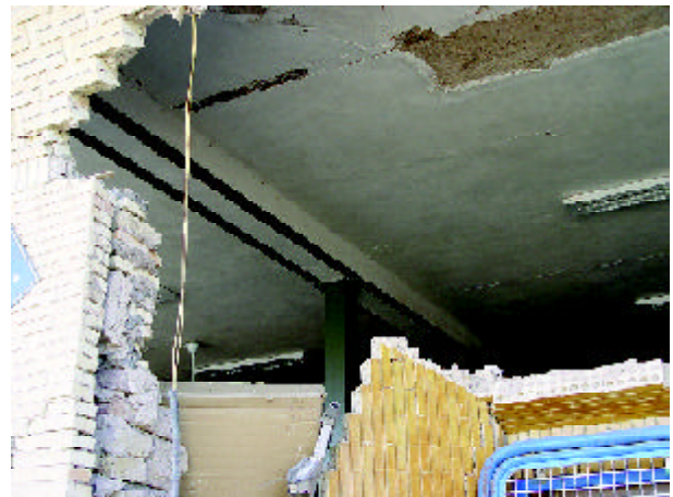
Figure 9. Severely damaged interior partition.

facade in Bam. Several cases of damage to the 3cm brick facades and other brick facades were observed, of which a few samples are shown in Figures (10) to (16). Stone facades have also got damaged in many cases, a sample of which is shown in Figure (17). As it is seen in Figures (10) to (16) no specific pattern can be found for the damage of brick facades. They have got damaged in different building elevations with various forms and areas.