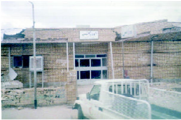
Figure 32. Damage to the glasses of widows in the Emergency Section of the city hospital.