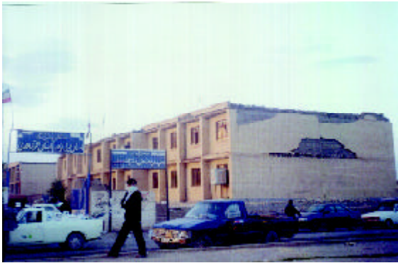
Figure 10. Damage to the so called 3cm brick facade in the second story of the Hijab girls' mid school