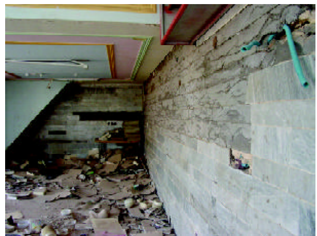
Figure 27. Severely damaged stone tile finishing of the interior wall of the Bank Refah Karekaran building.