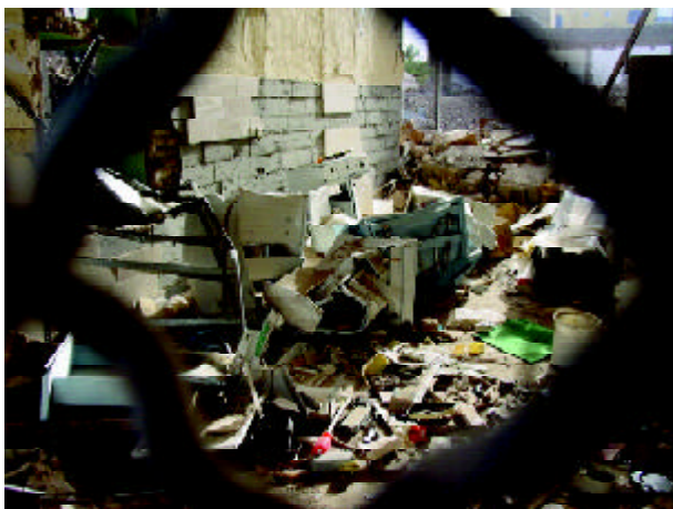
Figure 53. The entirely messed interior equipments of a shop

nomenon. The same weakness problem can be seen in Figure (52) which shows the toppled shelves of a shop. The fallen part of the gypsum finishing of the ceiling at the right corner in Figure (51) is notable, as in the safety rules, which should be followed inside a building in the time of earthquake, corners are usually suggested as the safer locations comparing to the other places in a room. The partial failure of the upper part of the wall on the right in Figure (52) is also notable. Figure (53) shows the entirely messed interior equipments of another shop in which the collapse of the stone veneer of the left wall is also visible.