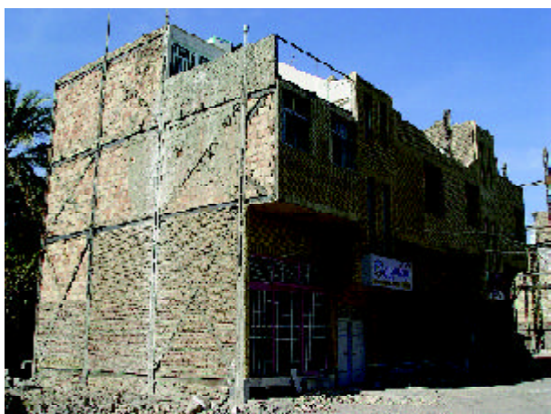
Figure 38. Collapse of parapets in the Iran Insurance Company building (Photo by M. Hosseini).

Figure (41) shows the collapsed tablets and bill board of a commercial building. Regarding the relatively low weight of the bill boards it can be claimed that the connection between the boards and their frames have not been strong enough to resist the earthquake shock. A part of the stone façade of the parapet has also failed, which is basically because of the failure of the whole parapet from that point to right (not completely shown in the picture). This again confirms the directivity effect of the earthquake.