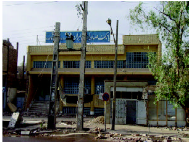
Figure 35. Damage to the glasses of widows in Bank Saderat Iran building (Iran Import Bank) (Photo by M. Hosseini).