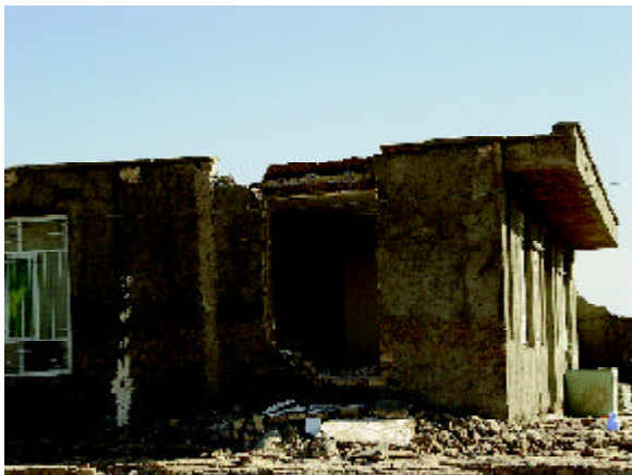
Figure 44. A popped out window in a one story residential building (Photo by M. Hosseini).

be due to the lack of enough connection between the windows and doors frames and their surrounding walls. In some cases, like the one shown in Figure (44), the popped out window has caused the failure of a part of the wall above it. The absence of the spandrel beam can be also another reason behind the popping out phenomenon and the consequent partial failure of the surrounding walls.