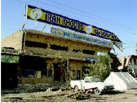
Figure 42. The windows in Iran Khodro building popped out of walls.

An almost newly observed phenomenon in this earthquake was the popping out of the windows and some door frames. Some samples of these cases are shown in Figures (42) to (44). This phenomenon can