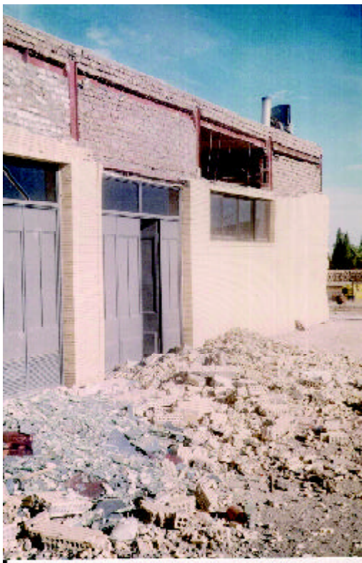
Figure 12. Damage to the brick facade in the top part of the walls in the logistic building of Azadi Hotel.

An interesting point, which is visible in Figure (13), is the lack of cohesion between the main wall masonry and the brick façade. The very clean surface of the concrete block masonry of the wall in this figure shows clearly this lack of cohesion. In the special case shown in this figure it seems the vertical box profiles of the top fence have prevented the façade from the complete collapse. Other interesting point is the detachment of the group of bricks with the used mortar behind them, which are stuck together and made a big piece of debris. It is obvious that falling of such a big piece from a high elevation can be very harmful to the subjected people. Nevertheless, this type of integrity between the bricks and the mortar can help their retrofit as described in section 5 of this paper.