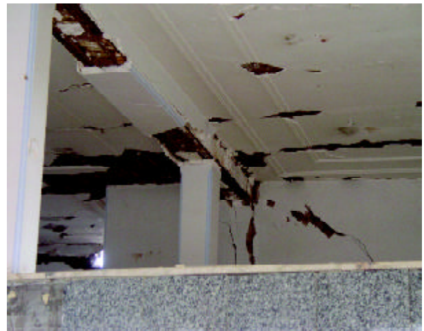
Figure 26. Severely damaged gypsum layer finishing of the ceiling of the Bank Refah Karekaran building.