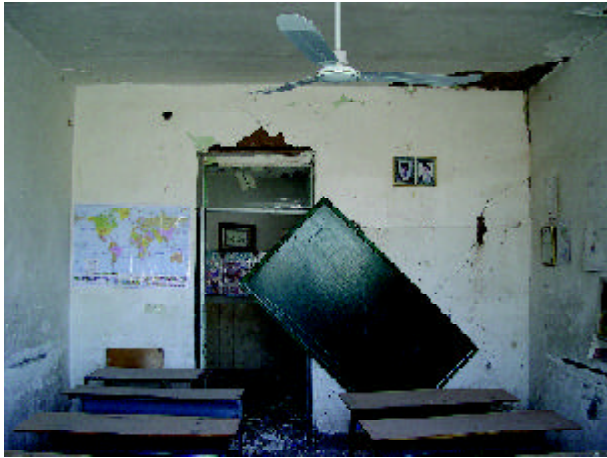
Figure 51. The semi-fallen blackboard due to the weak connection.

hook), still, because of the inherent weakness of the wall finishing and even the wall masonry, it would have detached from the wall because of notching phe-