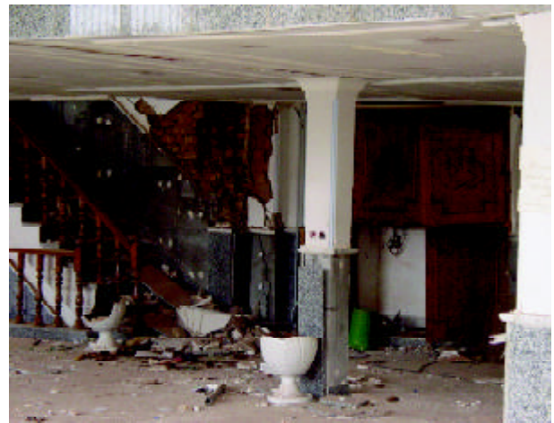
Figure 25. Severely damaged gypsum layer finishing of the interior wall of the Bank Refah Karekaran building.

The scattered locations of these damages again show the lack of uniformity in the construction process, which was also observed in the facades as discussed before. It is noticeable that in spite of