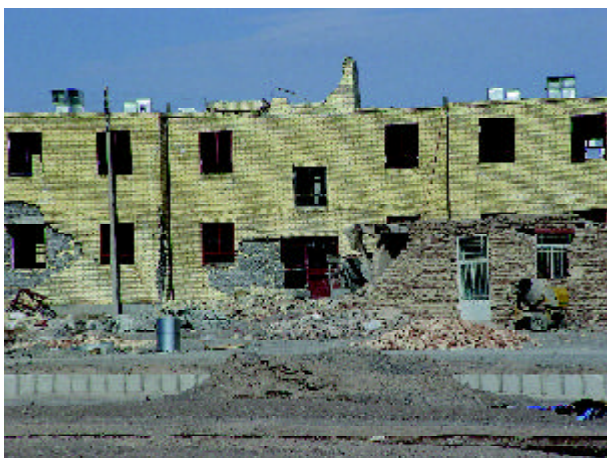
Figure 15. Damage to the brick facade in lower part of the two story residential buildings - Note to the collapsed penthouse as well (Photo by M. Hosseini).