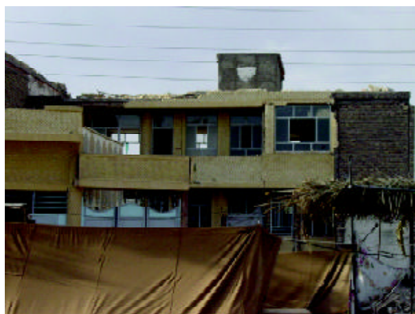
Figure 40. Complete collapse of parapets in a two story building.