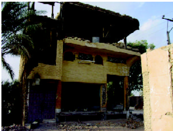
Figure 5. Collapse of the external wall masonry in the second and third stories of a 3 story steel structure building - the roof parapet has fallen as well (Photo by M. Hosseini).