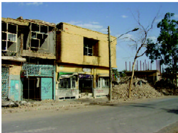
Figure 37. Damage to the glasses of widows in the second story of a residential building.

parapets in the front elevation of the building have collapsed, while in the other direction the relatively high and slender parapet has survived. This shows the high directivity effect of the earthquake.