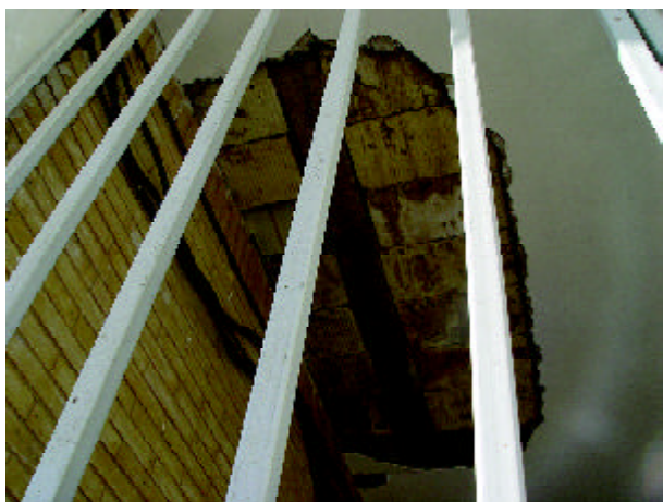
Figure 28. A big part of gypsum veneer of the ceiling has separated and fallen.

having a mezzanine part in this building as shown in Figure (24), which makes building an irregular one, its structural behavior has been almost satisfactorily. It is also notable in Figures (24) and (26) that the sizes of the fallen parts of veneers are quite large and it is obvious that the debris with this size can be seriously harmful to the people, considering particularly the height of the ceiling. This size problem is also observable in Figure (28), which shows a part of ceiling of which a big part of gypsum veneer has separated and fallen.