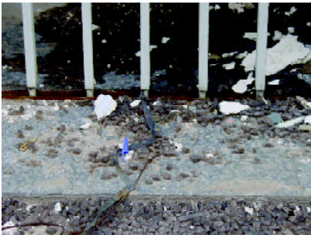
Figure 33. Splashed Parts of the broken thick glass door of Bank Refah Karekaran building.