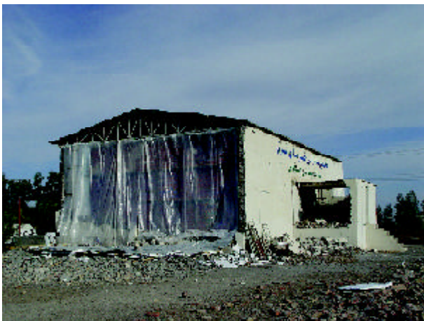
Figure 2. Complete collapse of the external wall of the refrigeration saloon of Khormaye Shargh (east date) export company made of concrete block masonry (Photo by M. Hosseini).

Another case of damage to the external walls is shown in Figure (2), which is related to Khormaye Shargh (East Date) export company. The complete collapse of the end wall of the refrigerating hall is seen in the figure. It is also seen that one wall of the motor house beside the hall has collapsed. A close up of this fallen wall is shown in Figure (3). Examination of the building showed that there was not any internal stabilizing column or external buttress in that end wall. In the case of the motor house wall just its inherent weakness and little integrity with other walls can be