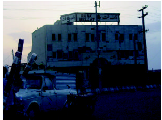
Figure 17. Damage to the stone tiles facade in Ban k Mellat building (Photo by M. Hosseini).

indicate again the non-uniformity of the construction work. The interesting point is the detachment of the group of tiles with the used mortar behind them, which are stuck together and make a big piece of debris. This case of stone tile failure was also observed in brick façade as shown in Figure (13).