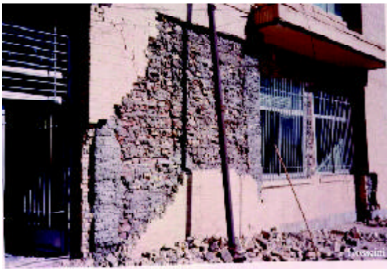
Figure 11. Damage to the so called 3-cm brick facade in the first story of the office building of the city electric substation.