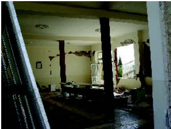
Figure 43. A popped out window in the electric substation office building.