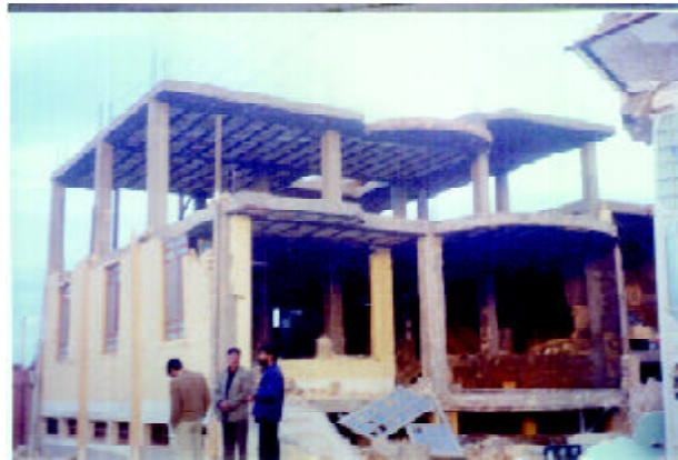
Figure 4. Collapse of external walls in an under construction R/C building, whose skeleton remained intact after the quake - Note to the fallen out window as well.

Other samples of the external walls failure are shown in Figures (4) and (5). The little integrity of these walls and their weak connections with the structures are believed to be the main causes of failure in these cases.