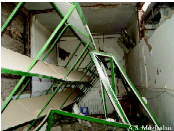
Figure 52. The toppled shelves of a shop board due to their weak connection.