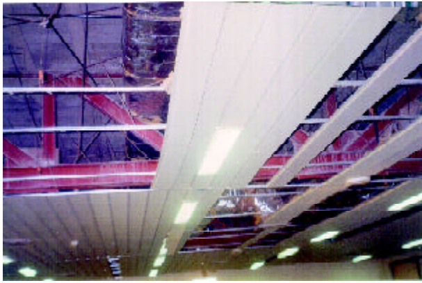
Figure 23. The false ceiling of the Bam Terminal Building, of which some part have fallen down because of instability