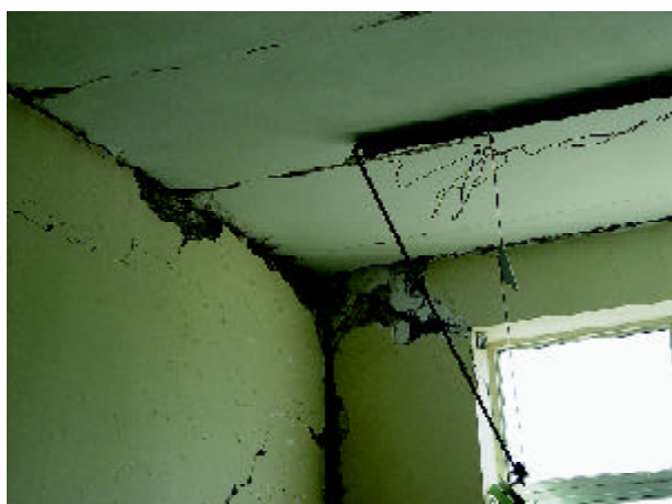
Figure 47. The failed light fixtures in the office building of the city electric power substation.