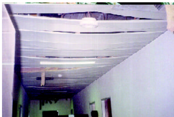
Figure 22. The deformed parts of the false ceiling in the Bam Airport Terminal Building.