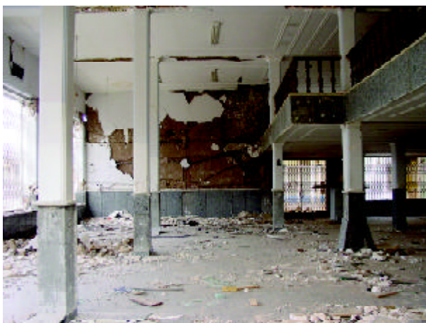
Figure 24. Severely damaged gypsum layer finishing of the interior wall of the Bank Refah Karekaran building.