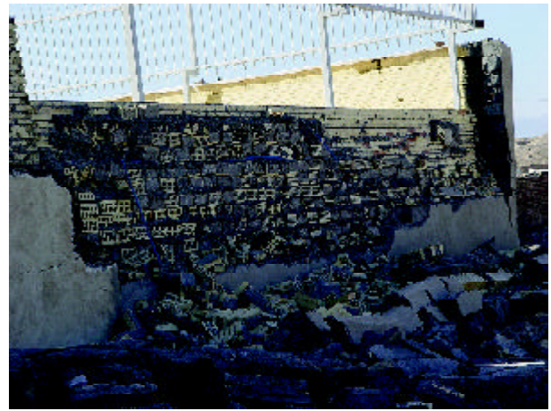
Figure 16. Damage to the plastered brick and block facade in a yard wall.