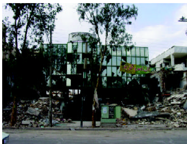
Figure 31. Damage to the glass facade of trade and tourism building (Photo by M. Hosseini).

Several cases of damages to the glass facades, thick glass doors, or window glasses were observed, of which a few samples are shown in Figures (31) to (37). The scattered locations of the broken glasses in Figure (31) show again the non-uniformity of the material and construction process. In Figure (32) in addition to the broken glasses of windows the cracked and partially fallen parapet of the Emergency Section of the city hospital is also noticeable. In Figure (33) the size of the broken parts of the thick glass door of Bank Refah Karegaran (The Workers Welfare Bank) can be realized by comparison with the size of the pen cap in the middle of the picture in light blue color.