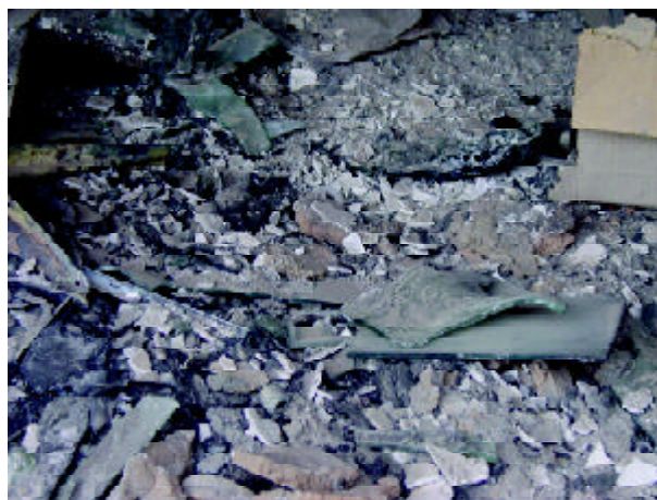
Figure 50. The deformed pieces of glass due to the fire occurred in the shop shown in Figure (49)