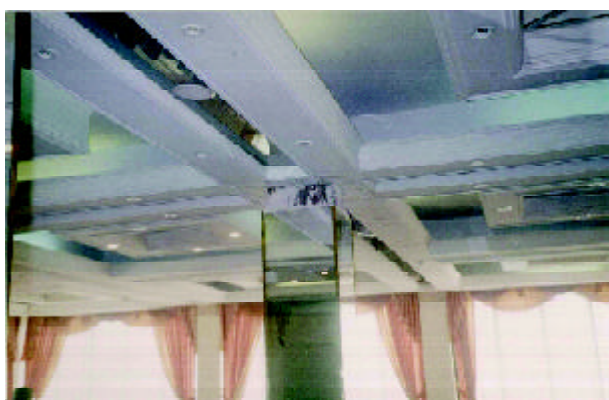
Figure 29. A sample of damages to the veneers of the columns tops in Azadi (Iran Parsian) hotel

Figures (29) and (30) show the damages to the interior veneers in the Azadi (Iran Parsian) hotel. The veneers of the upper part of almost all of columns in the lobby were damaged as shown in Figure (29). There were also some damages to the ceramic tile veneers in the bathrooms of the hotel as shown in Figure (30). An interesting point is that just a small part of the column veneer as shown in Figure (29) was damaged, while the lower part which is covered